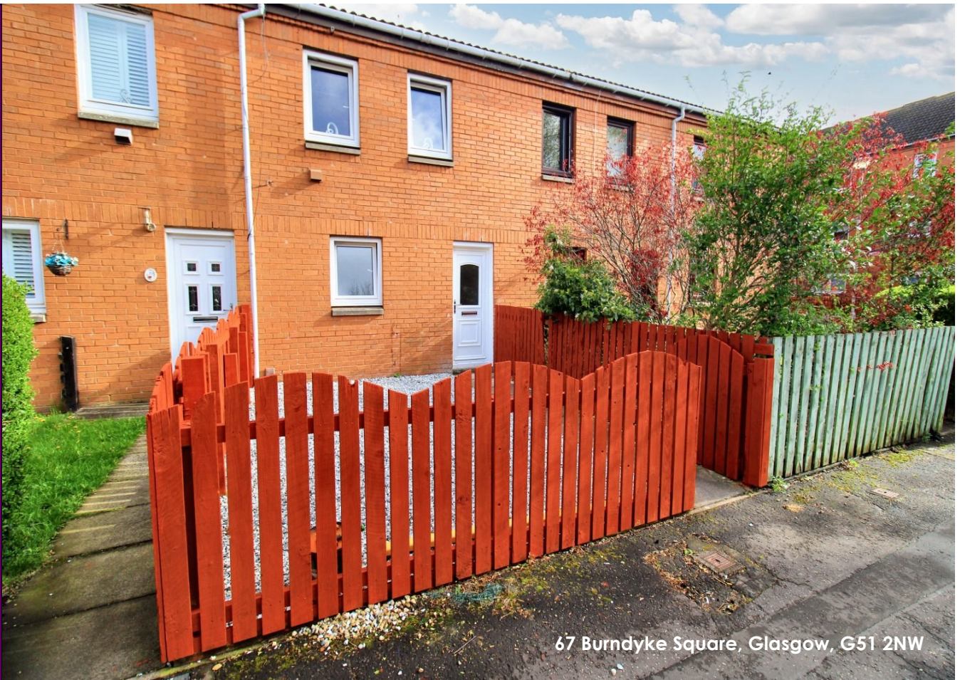
67 Burndyke Square, Glasgow, G51 2NW

This recently refurbished four-bedroom mid-terrace townhouse sits in a quiet cul-de-sac in this popular southside location and offers versatile accommodation over three levels. Property comprises, on the ground floor, entrance vestibule, hallway with deep under-stair storage, double bedroom, WC and dining kitchen which benefits from modern fitted base and wall units and ample space for white goods and dining table and chairs. On the first floor the middle landing gives access to the spacious lounge, double bedroom and shower room. The top floor landing gives access to a further double bedroom, bedroom 4/home office and shower room. The specification of the property includes gas central heating and double glazed windows. Externally, there are private garden grounds to the front and rear which are both fully enclosed.